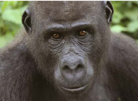
The face of a bushmeat orphan.

“One of the greatest threats to wild gorillas, Koko’s cousins, is the currently unbridled slaughter, carried out by professional hunters, to satisfy a growing demand for primate meat. This market is greatest amongst Africa’s urban