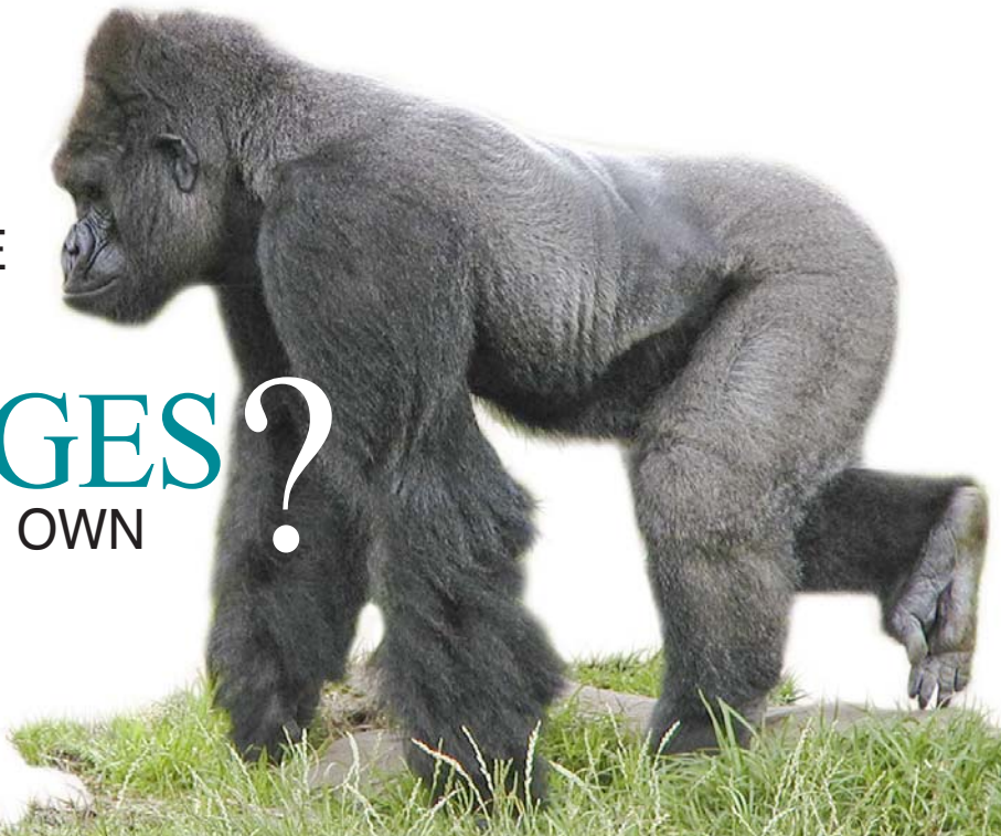
Photo of Kubie, Koko's brother

A summary of “The development of spontaneous gestures in zoo-living gorillas and sign-taught gorillas: from action and location to object representation”