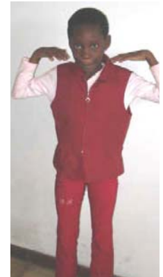
Members of Koko’s Cameroonian fan club demonstrate signing in ASL.

forces on the entire continent of Africa promoting conservation values, the Gorilla Foundation has seen the need for bringing this outreach into other countries that gorillas call home. With Ambassador Koko leading the way, real changes in attitudes and behavior will lead to lasting change for the better for all gorillas. It is one very critical path to ensure that hunting will decrease, that habitat can be preserved, and that gorillas can be saved from extinction. ■